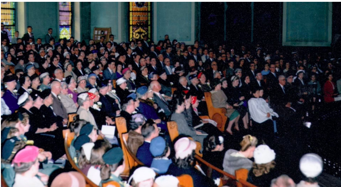
Final worship service at Baltimore Street location

A 1955 special program noted that the choir had 12 sopranos, 8 altos, 7 basses and 5 tenors.